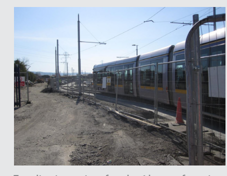
Tramline in service after the 6 hours of pouring Promptis® concrete.